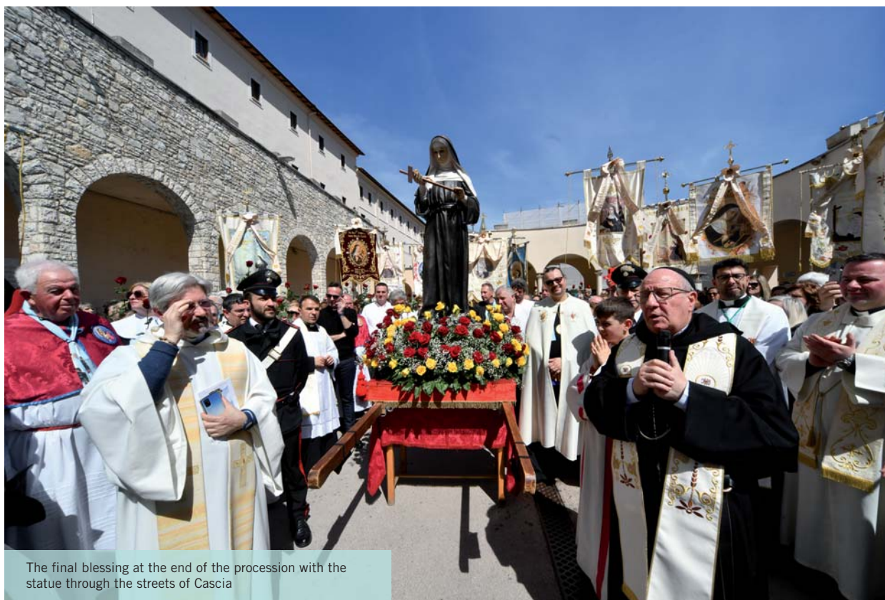
The final blessing at the end of the procession with the statue through the streets of Cascia