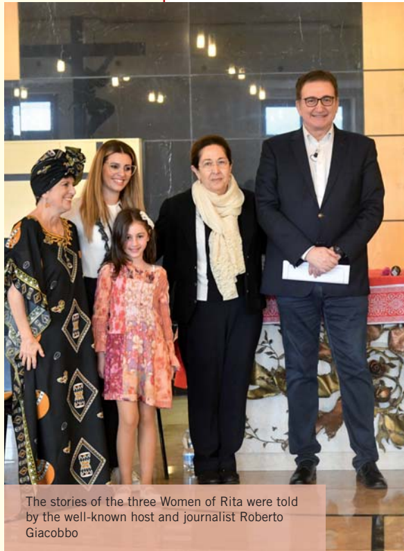
The stories of the three Women of Rita were told by the well-known host and journalist Roberto Giacobbo

These three women are different but united, like so many in the world, by the choice to be instruments of life today, like Saint Rita did in the past. From them, we learn to be cradles for life and wings of hope.