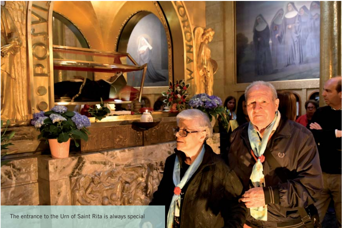
The entrance to the Urn of Saint Rita is always special

thank the sisters, who supported her from afar with prayers throughout her illness and convalescence. “I came to meet them and thank them,” she told me.