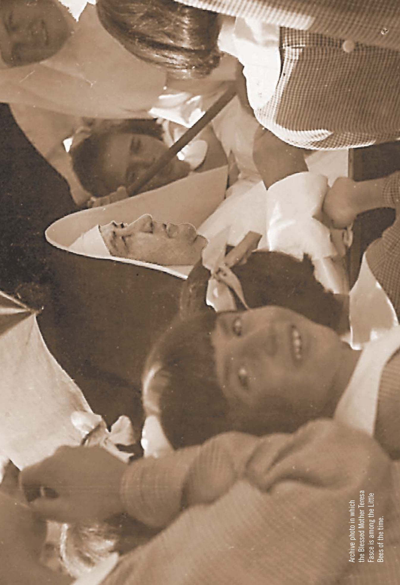
Archive photo in which the Blessed Mother Teresa Fasce is among the Little Bees of the time.