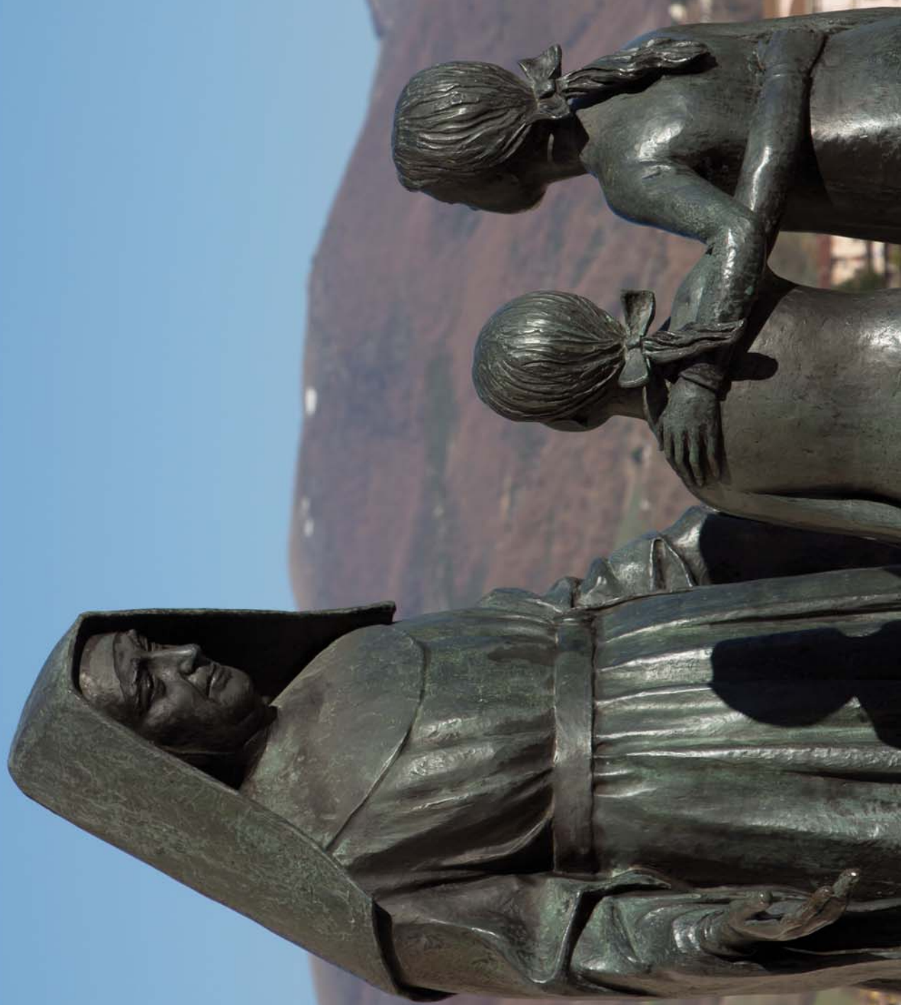
Mother Fasce and her Little Bees. Monument placed at the beginning of the tree-lined Sanctuary avenue.