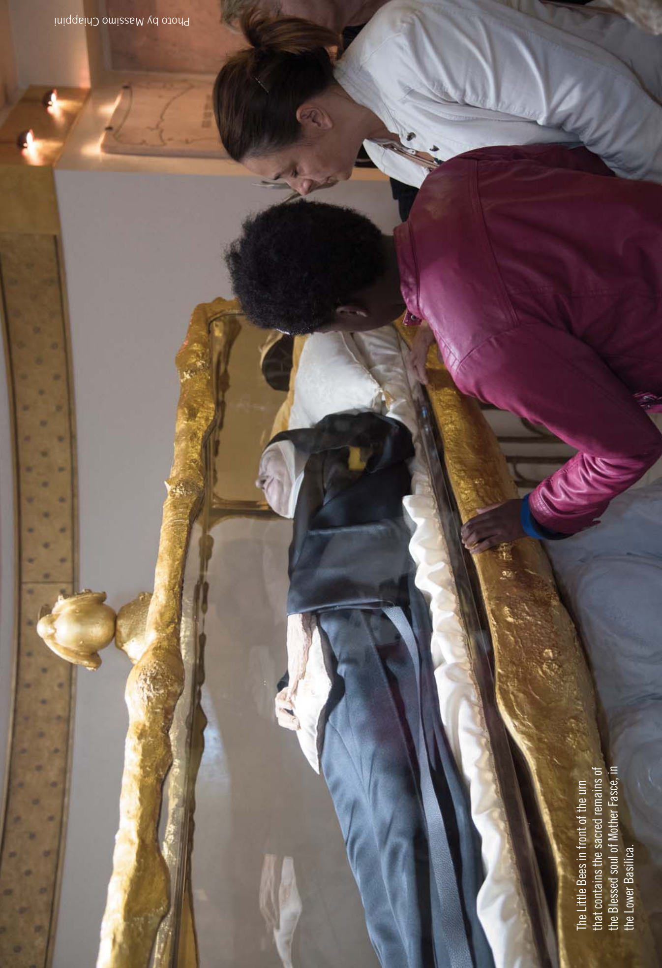
The Little Bees in front of the urn that contains the sacred remains of the Blessed soul of Mother Fasce, in the Lower Basilica.