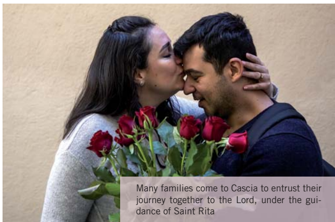
Many families come to Cascia to entrust their journey together to the Lord, under the guidance of Saint Rita

St. Joseph made the mystery of what was in Jesus blossom. What can we say about the role of the father in modern families? First of all, the fact that Joseph is in some way the guarantor and guardian of Jesus' greatness. This is expressed through an act that is somewhat underestimated by common readings: the first thing that the Angel asks Joseph, in addition to taking Mary and the Child with him, is to give him his name. He must say to Jesus: 'you are salvation'. Giving a name to the boys, girls and young people of this generation is the way to deliver their importance, their truth. Returning to St. Joseph, he was also someone who knew how to take a step back and disappear at the right moment. And this is the father's task - at a certain point he must allow the son to become the central point.