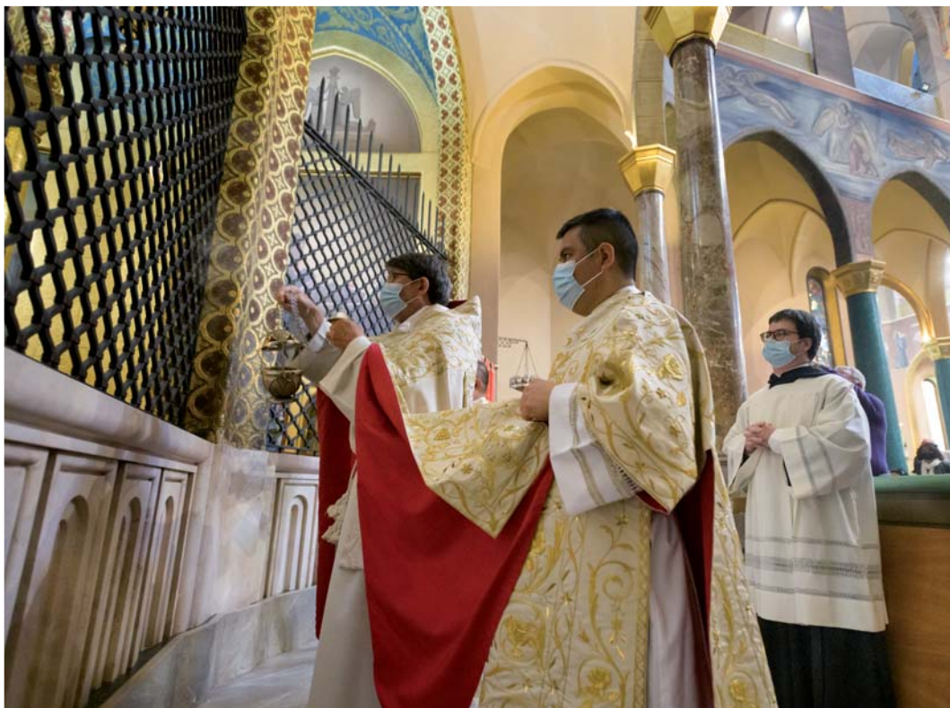
One of the moments of the Solemn Transit of Saint Rita on 21 May

The presence of Saint Rita was perceived to be as strong as ever