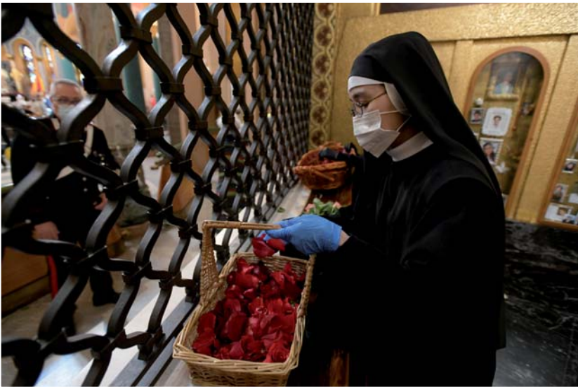
The Nuns gave out thousands of blessed rose petals at the Urn of Saint Rita

return found a fruitful gift, that seed of love that is renewed every time and always increases our strength to go forward. This is the hope of those who experienced the celebration as a blessing from all over the world!