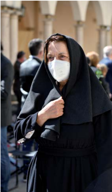
Rita the widow is one of the characters of the historical parade on 22 May

The live broadcast on 22 May opened with a message of good wishes from the nuns, who said to you devotees: "The feast of Saint Rita of Cascia holds us all in her embrace and in her heart.