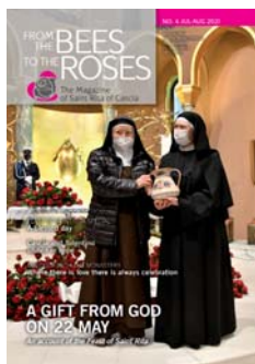
On the cover: "The two Prioresses". (see pp. 18-19)