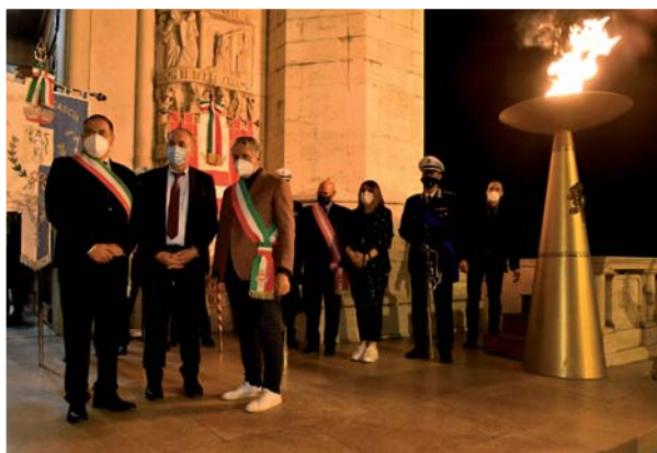
The lighting of the Votive Tripod in the churchyard of the Basilica inaugurated the celebrations

The examples given by the lives of Saint Rita and Saint Nicholas of Tolentino touch on two key topics for this edition: family, as we are now in the Amoris Laetitia Family year called for by Pope Francis, and healing. Starting from these themes, the path laid out is that of Rita and Nicholas, who spent most of their lives honouring the