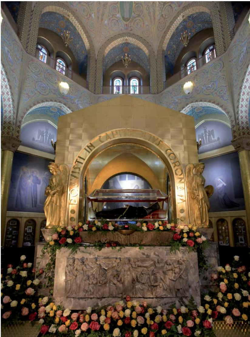
The Urn of Saint Rita adorned with hundreds of coloured roses for the feast

On the day of the vigil, the live broadcast took you to the Basilica of Saint Rita so you could experience the Eucharistic Celebration of the Augustinians together,