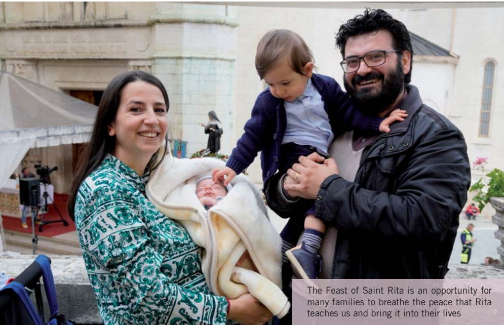
The Feast of Saint Rita is an opportunity for many families to breathe the peace that Rita teaches us and bring it into their lives

because there are many people who, for many reasons, will never be able to come to Cascia, to Rita's house. And therefore, Saint Rita makes home and has an important place in our hearts, in all of the world's devotees. It is precisely feeling Rita in us that makes us celebrate her feast on May 22, together, wherever we are. So, it is essential to make Ri-