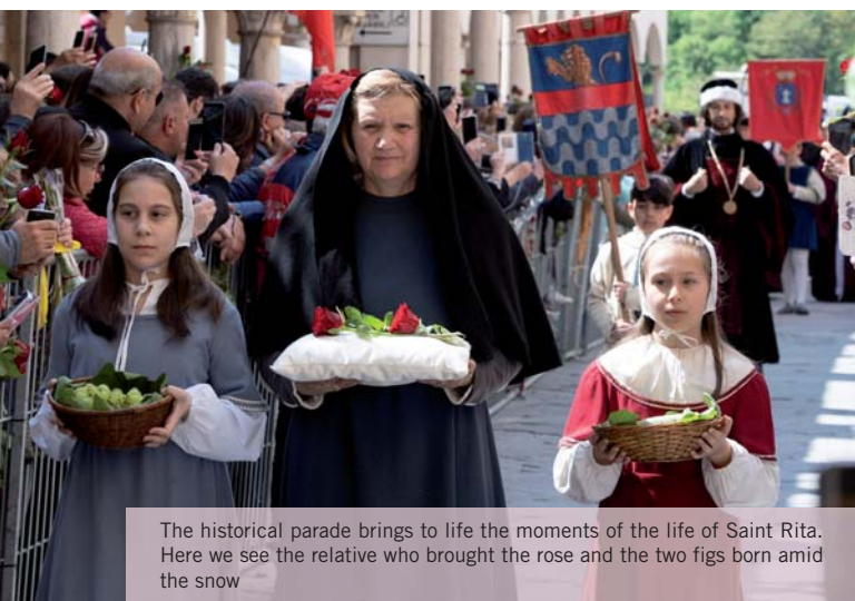
The historical parade brings to life the moments of the life of Saint Rita. Here we see the relative who brought the rose and the two figs born amid the snow