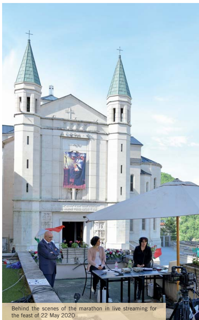
Behind the scenes of the marathon in live streaming for the feast of 22 May 2020

by millions of devotees in every corner of the Earth. Every year, everyone wants to be present to celebrate Rita in Cascia, where her body is kept and where they feel even more like a family. But for many devotees this remains just a dream. How-