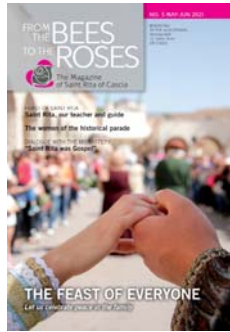
On the cover: The feast of everyone Photo: Detail of the historical procession of Saint Rita on May 22.