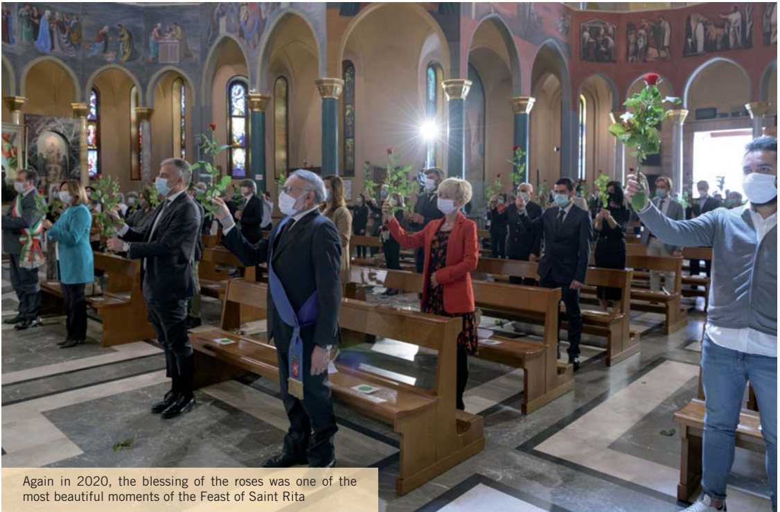
Again in 2020, the blessing of the roses was one of the most beautiful moments of the Feast of Saint Rita

ever, it is dreams that make us enter an inner world, that place where the impossible becomes possible. I'm talking about the heart. The heart is our true home, the place where we can overcome every border, reach deep communion while being at a great distance, share faith, joy and life even if we speak different languages, because the language of the heart is that of love which everyone understands. Here is the “secret” of the Feast of Saint Rita, which takes place in the hearts of devotees from all over the world. And it is precisely to make the dream of all those devotees who cannot be present in Cascia come true that we have found a virtual way to bring the feast into everyone's homes. Last year we did it through the “Saint Rita Feast Marathon”, the live streaming event that went online on all channels of the Monastery of Saint Rita of Cascia. Today, the video of May 22, 2020 has made history with more than 260