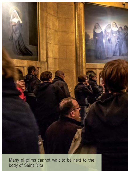
Many pilgrims cannot wait to be next to the body of Saint Rita

family or in the bus of an organised pilgrimage, with heart full of prayer and hope, cannot wait to be next to her. Kneeling speechless in her Sanctuary, in front of her body which is kept there, he/she prays as Saint Augustine did on his pilgrimage in search of God: “My sighs to you in my pilgrimage” ( Confessions XII, 15:21 ). In fact, in front of Saint Rita, the pilgrim does not speak, but confesses their whole heart soaked with tears and