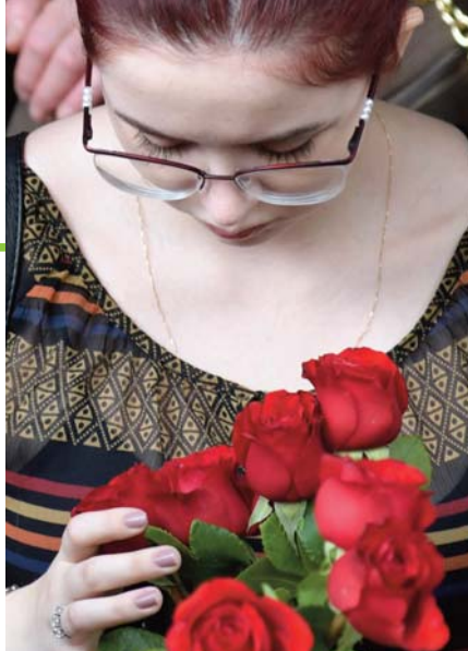
Roses, the symbol of Saint Rita, always accompany pilgrims