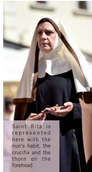
Saint Rita is represented here with the nun's habit, the crucifix and the thorn on the forehead

would like to touch the clothes, who ask us for explanations about the characters who not only applaud but pray as the parade passes, their joy becomes ours". The work of these women contributes to making it possible to repeat that appointment every year, the value of which lies in its universal significance: anyone, from whatever part of the world they come, can know and understand the life of Saint Rita within her historical context, simply by observing the parade. A parade that is almost identical year after year, but which finds its communicative strength in reminding all the faithful that Rita's message is her own life.