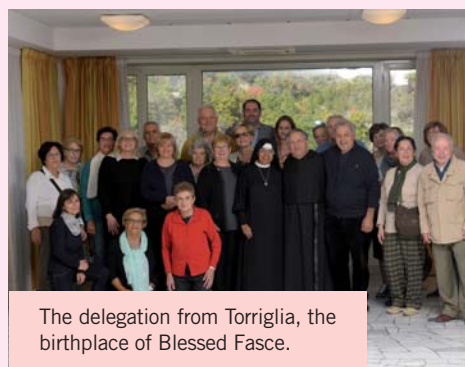
The delegation from Torriglia, the birthplace of Blessed Fasce.