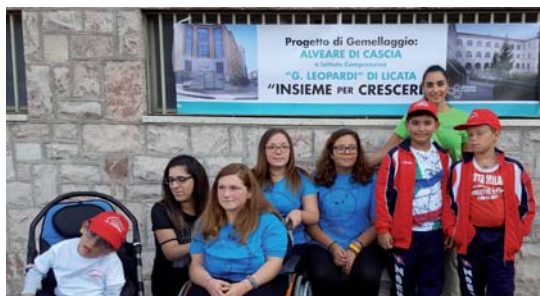
The Leopardi Comprehensive School in Licata (Agrigento) and the Beehive of Saint Rita are united in a twinning of friendship and hope.

the Eucharist that took place in the Lower Basilica. Our guests could feel the proximity and affection of the community of Augustinian nuns through the words of Mother Prioress. At the end of the celebration, our greeting and a visit to the Beehive could not be missed. We talked about the various projects that we are pursuing and left each other with the hope of meeting up again at the end of this school year. In this way we can cultivate and make our friendship grow.