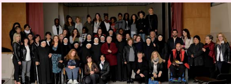
Former Little Bees at the mini-gathering on October 15.