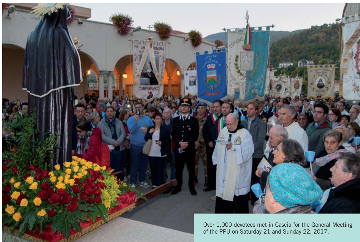
Over 1,000 devotees met in Cascia for the General Meeting of the PPU on Saturday 21 and Sunday 22, 2017.