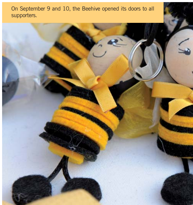
On September 9 and 10, the Beehive opened its doors to all supporters.