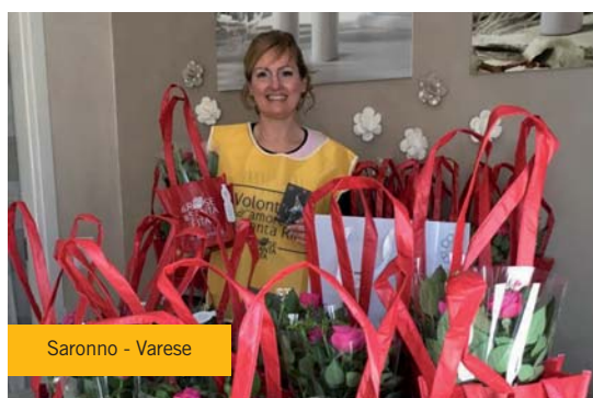
Saronno - Varese

Joy, spirit of initiative and devotion gave the right stimulus and great enthusiasm to the over 300 volunteers who, united in the love of Saint Rita, joined this special edition of the solidarity event to raise funds for the fourth consecutive year in favour of the Beehive and the Little Bees.