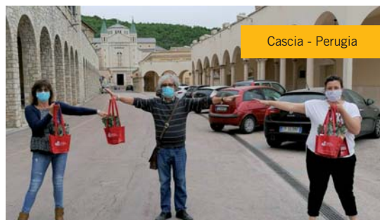
Cascia - Perugia

The warmhearted involvement of family and friends made it possible to distribute the Roses of Saint Rita, which this year more than ever represented the symbol of hope and rebirth of the whole of Italy.