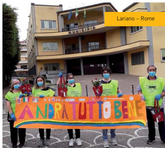
Lariano - Rome

From northern to southern Italy, including the islands, volunteers were motivated by a strong sense of rebirth and gradual return to normal, in full compliance with safety regulations. Because, with love, everything is possible. They proved to be original and creative, setting up stalls with roses at home or in shops, in garages or through home deliveries, in order to be able to distribute them.