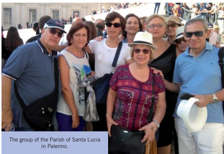
The group of the Parish of Santa Lucia in Palermo.