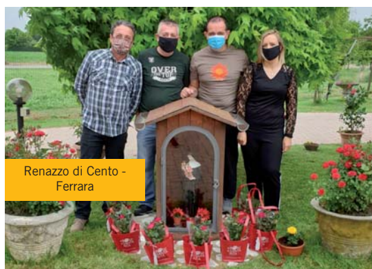
Renazzo di Cento - Ferrara

The Roses of Saint Rita event was held in May in an unusual way, through online orders, given the conditions imposed by the pandemic. However, nothing stopped the volunteers who, despite not being able to go into the squares throughout Italy, created a true network of love which sowed hope, bringing the presence of Saint Rita into homes in time for the feast of May 22. All the photos illustrating the 2020 edition are on www.rosedisantarita.org/gallery