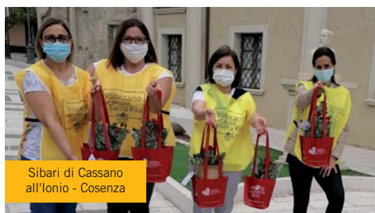
Sibari di Cassano all'Ionio - Cosenza

Joy, spirit of initiative and devotion gave the right stimulus and great enthusiasm to the over 300 volunteers who, united in the love of Saint Rita, joined this special edition of the solidarity event to raise funds for the fourth consecutive year in favour of the Beehive and the Little Bees.