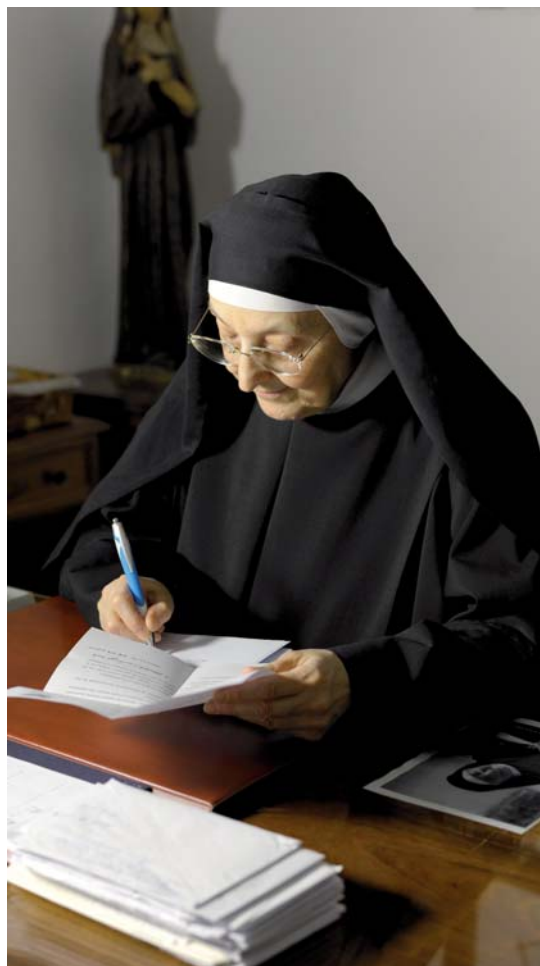
The nuns have always guaranteed the listening service and have never allowed the proximity and consolation of Saint Rita for the faithful to be missing.

alone, bringing directly into homes the embrace and comfort of the saint of the impossible and of hope, who always reminds us that by entrusting ourselves to God everything is possible. In this way, the work