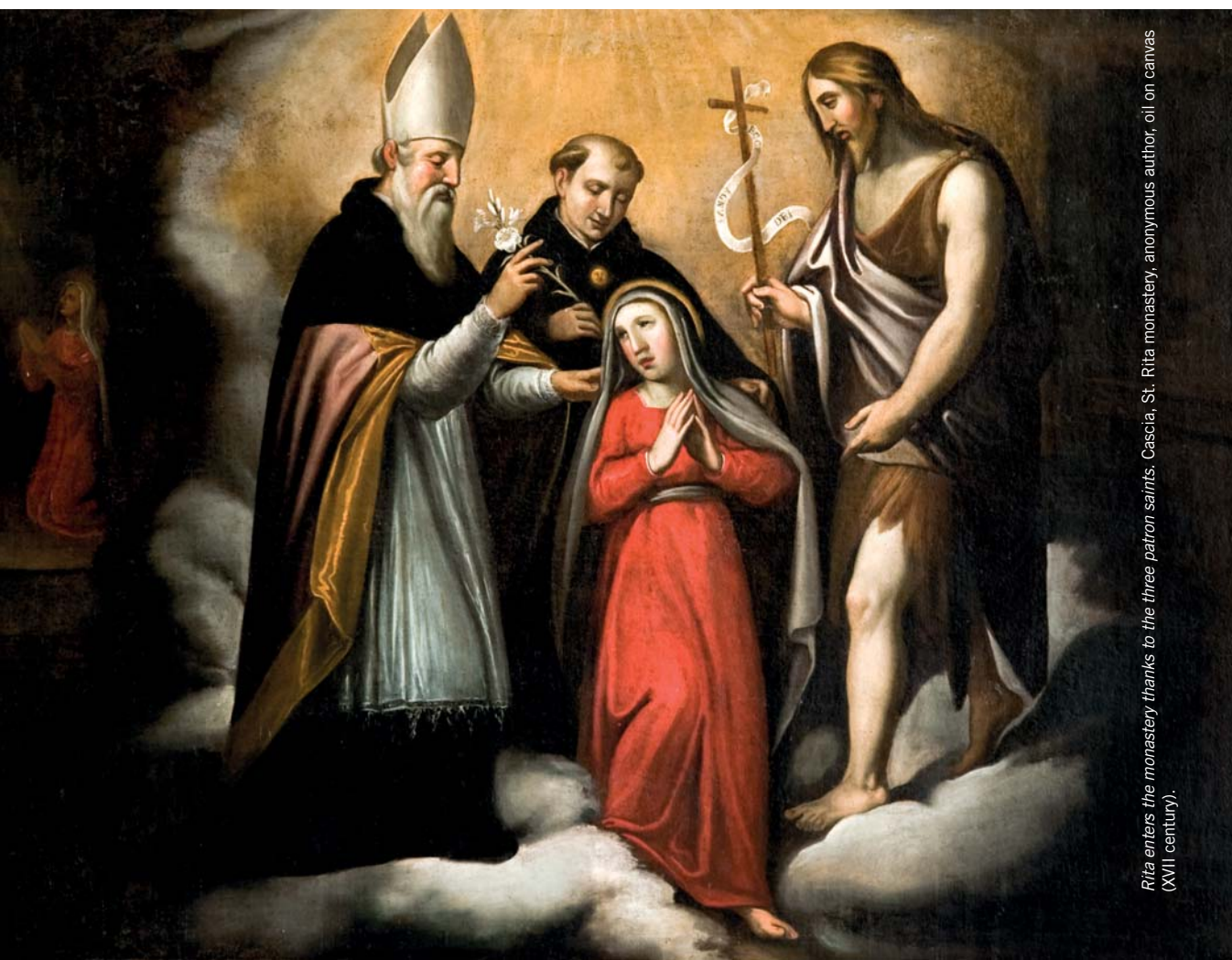
Rita enters the monastery thanks to the three patron saints. Cascia, St. Rita monastery, anonymous author, oil on canvas (XVII century).

flounders, including that which has Saint Rita as a woman who flies “on brooms”! So where does this flight come from? Perhaps it is simply the popular interpretation of the seventeenth-century canvas that represents the three patron saints and Rita in the clouds (clouds are never missing in apparitions). The interpretations disappear like fog in the sun! What re-