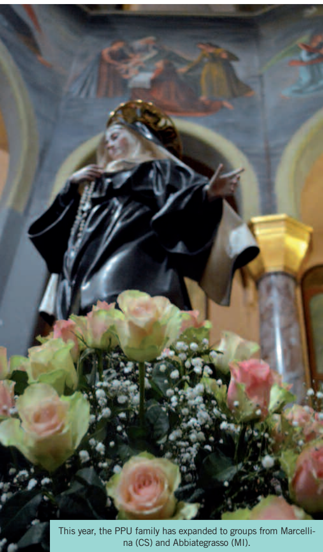
This year, the PPU family has expanded to groups from Marcellina (CS) and Abbiategrasso (MI).