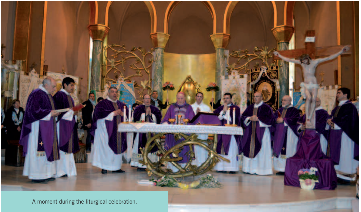
A moment during the liturgical celebration.