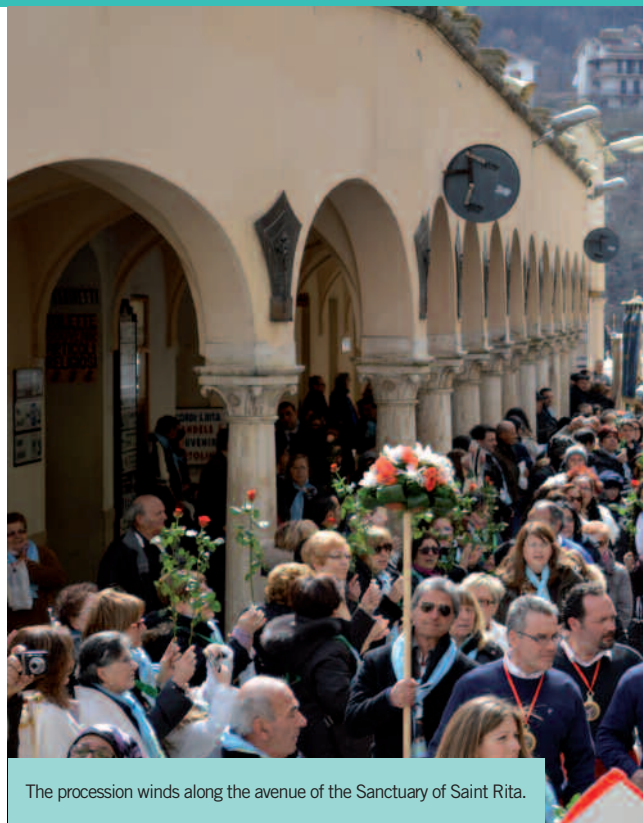
The procession winds along the avenue of the Sanctuary of Saint Rita.