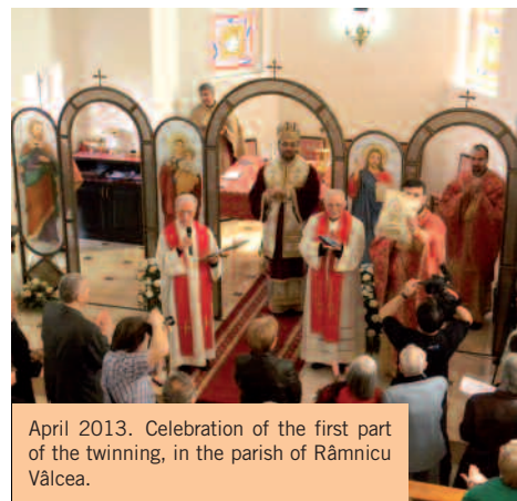
April 2013. Celebration of the first part of the twinning, in the parish of Râmnicu Vâlcea.

the deed for the foundation of the Parish of Râmnicu Vâlcea on the afternoon of 6 July 2001. Since then, we have been engaged in hard and radical work aimed not so much at the construction of a parish church, as at strengthening the faith of the few Christians present. Step by step, on 15 August 2001, the Feast of the Assumption of the Virgin Mary, the first mass of the Greek-Catholic community of Râmnicu Vâlcea was celebrated in the Roman Catholic Church of Sfântul Anton. Then, on 22 May 2005, the foundations were laid of the future parish church dedicated to Saint Rita of Cascia, patroness of the Community together with the Blessed Virgin Mary. Overcoming all obstacles, on 1 October 2006, all of us had the immense joy of participating in the dedication of the church of the Romanian United with Rome, Greek-Catholic Church in Râmnicu Vâlcea to the Saint of Cascia. Over time, we have enjoyed a series of extraordinary events, such as the Peregrinatio (pilgrimage) of the relic of Saint