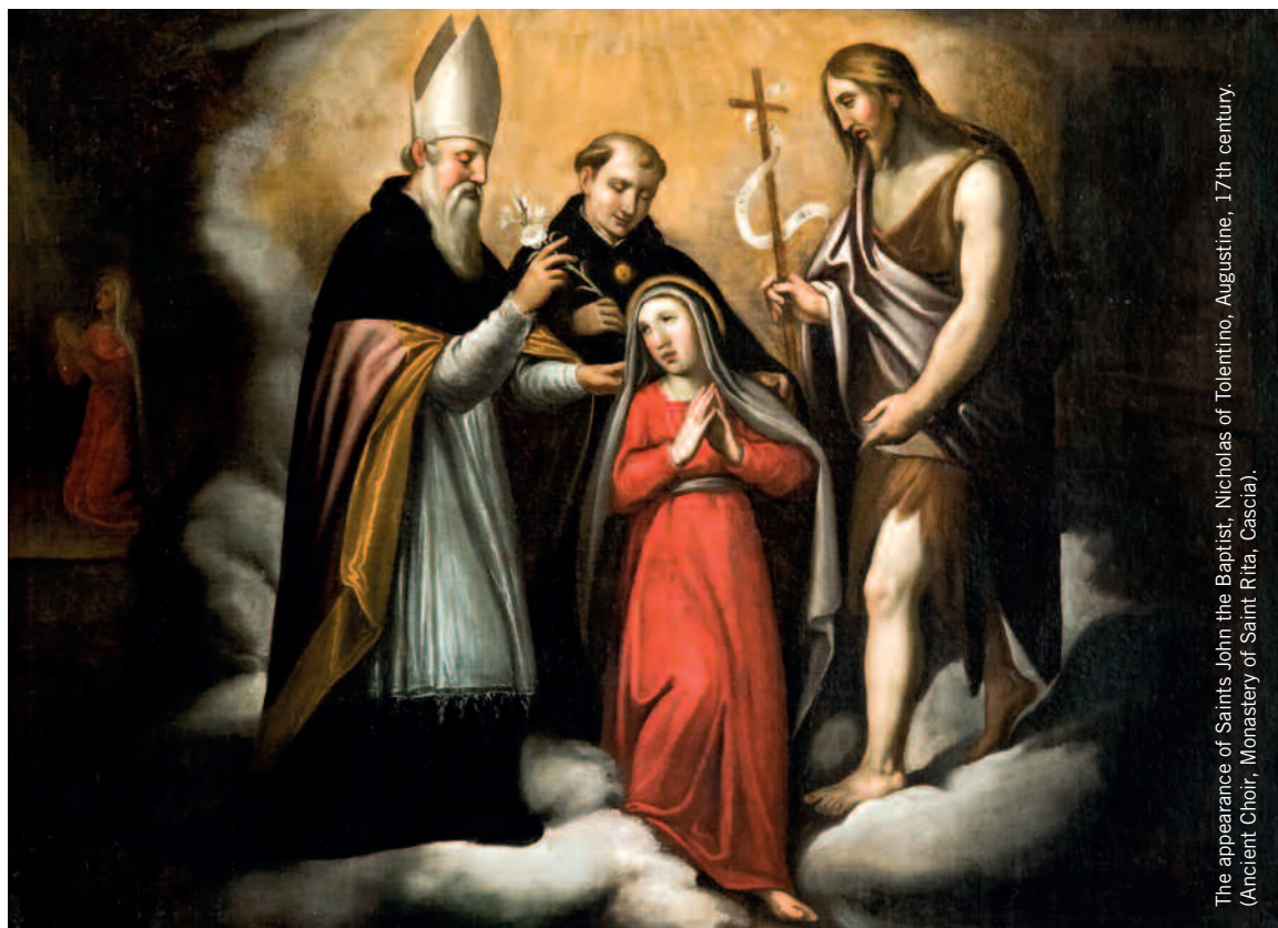
The appearance of Saints John the Baptist, Nicholas of Tolentino, Augustine, and Rita. (Ancient Choir, Monastery of Saint Rita, Cascia).

for their imitation” (SC 111). Many women and men of our own time declare their devotion to Saint Rita, and perhaps we ourselves are among these; however, we might ask to whom Rita herself was devoted. Obviously, the spirituality of Rita is centred on the passion of Christ; his forehead, marked by the stigma of the spine, was the outward and visible sign of a completely internal assimilation of the Crucifix. Rita was also devoted to Mary, dearly loved by all the people of Cascia. But among the saints, which did she choose as her special patrons? Ancient tradition answers the first question, indicating John the Baptist, Augustine and Nicholas of Tolentino as the protectors of Rita, but does not explain why them and not others. Perhaps we can find an explanation by carefully scrutinising Rita’s life and the way in which she imitated her heavenly patrons. John the