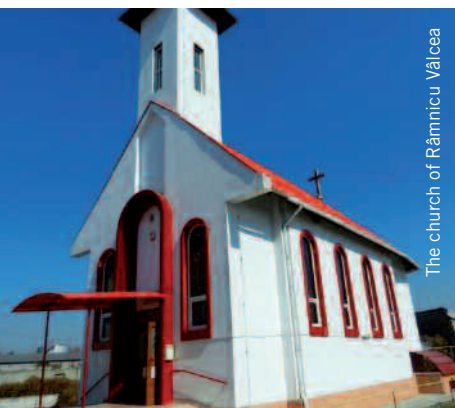
The church of Râmnicu Vâlcea

Rita in 2011 and 2012. Today, Rita is loved and prayed to in a world, the Orthodox world, where she was little known. It was because of this great devotion to Saint Rita that I asked to start the process of the Twinning of Faith and Peace, on the occasion of the Feast of Saint Rita in 2013 (May 20 to 22) and which will see the two communities, the Sanctuary of Cascia and the Parish Church of Saint Rita of Vâlcea, and the two municipal authorities, celebrate an event in honour of the Saint of Cascia, committed to restoring peace in a world torn by strife and discord. ■