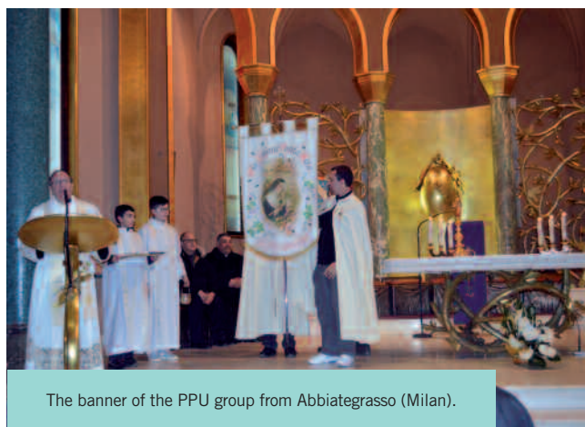
The banner of the PPU group from Abbiategrasso (Milan).