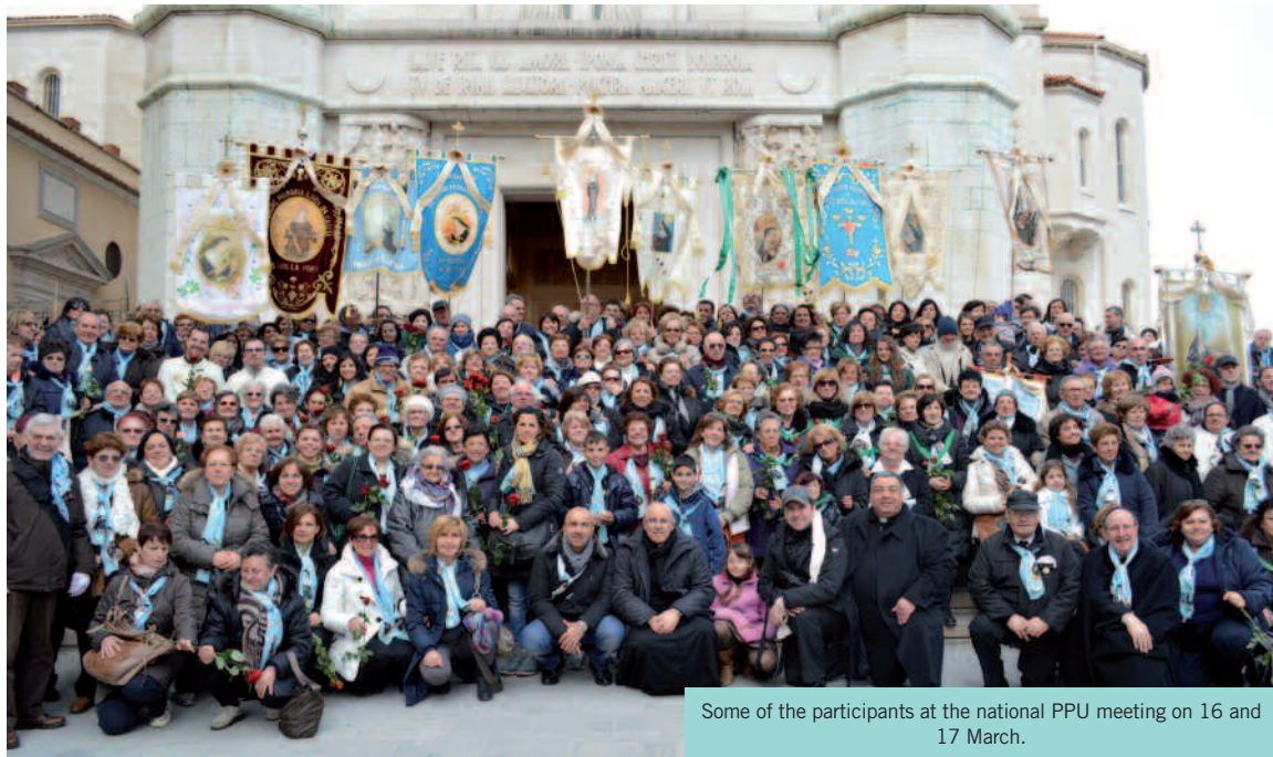
Some of the participants at the national PPU meeting on 16 and 17 March.