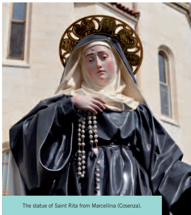
The statue of Saint Rita from Marcellina (Cosenza).