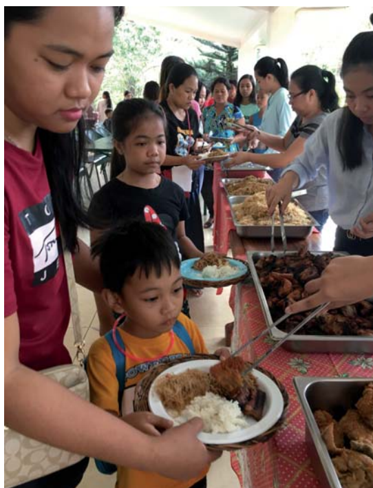
Many young people at the first Christmas dinner in Bulacan.

“Cooked for Love”, which is an addition to the solidarity gifts of the “Made for Love” line, was only the first step in a work of charity towards the last, which the Foundation would like to become the digital appointment of every Christmas.