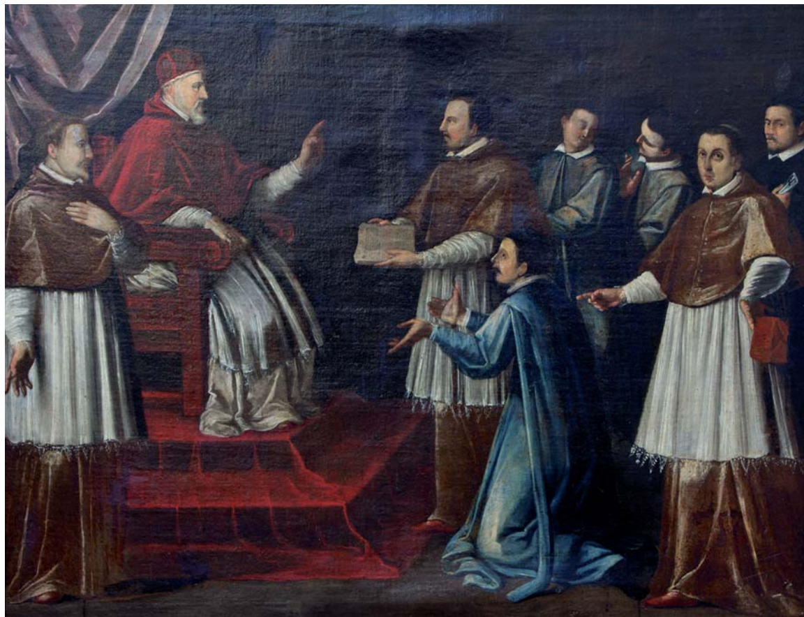
Urban VIII receives and approves the process for the recognition of the cult of Saint Rita. Cascia, Monastery of Saint Rita, anonymous painter (XVII century)

dren would never try to avenge their father. The two boys did not even have time to harbour feelings of revenge because, while Rita was still in mourning for her husband, both died, perhaps due to the recurring plagues that decimated Europe from the 14th century onwards.