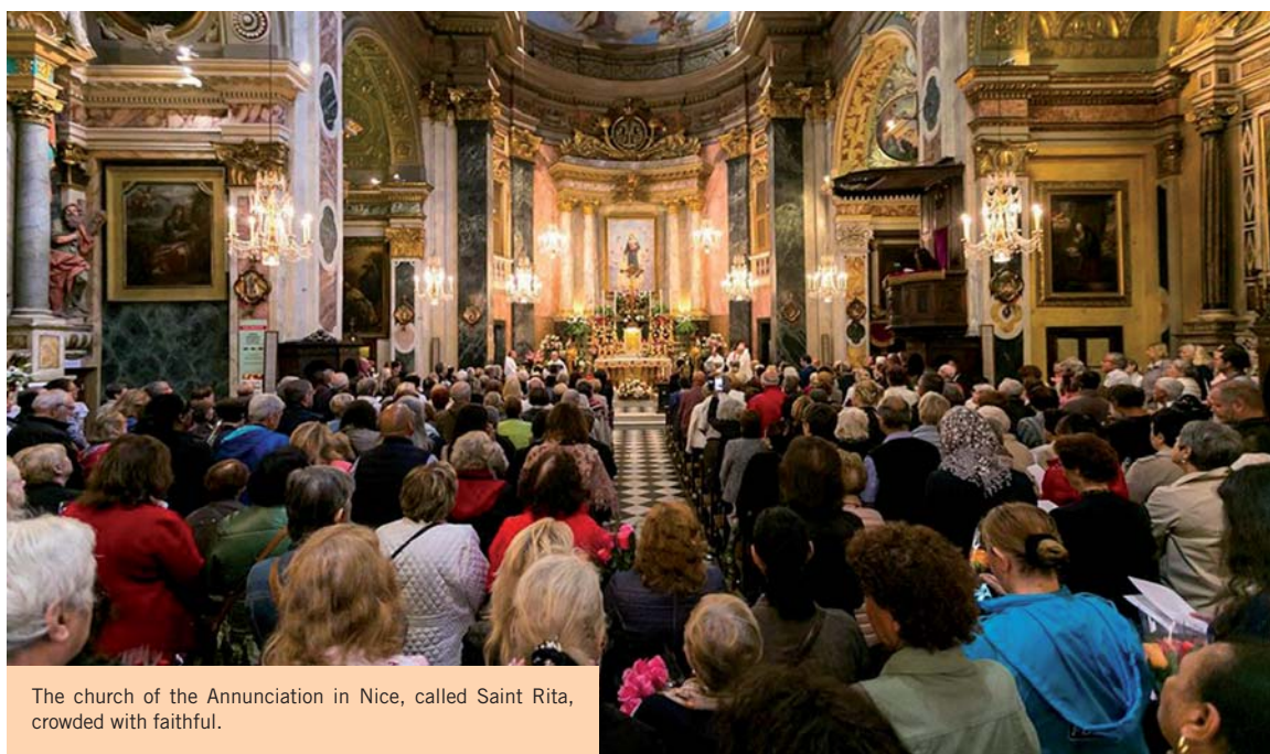
The church of the Annunciation in Nice, called Saint Rita, crowded with faithful.

ing the universality of the Ritian message. The strong devotion to the saint translates into celebrations very similar to those in Cascia: preparation of the feast with the “Fifteen Thursdays of Saint Rita”, during which prayers are addressed to the miracle worker and moments of her life are recalled; the Novena, a Mass on May 21, with the reading of prayers of intercession; and a great celebration on the day dedicated to her, also transmitted through the parish website and Facebook page. The latter are instruments that the Oblate Fathers