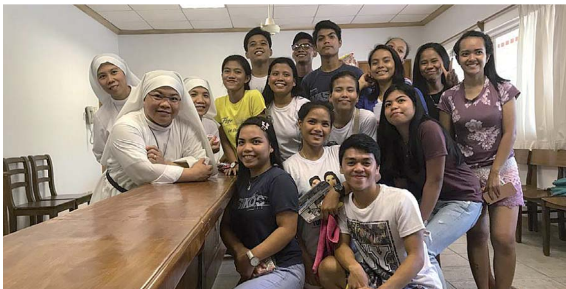
For the first time, the Augustinian missionaries were able to organise a real Christmas dinner for the poor and needy.