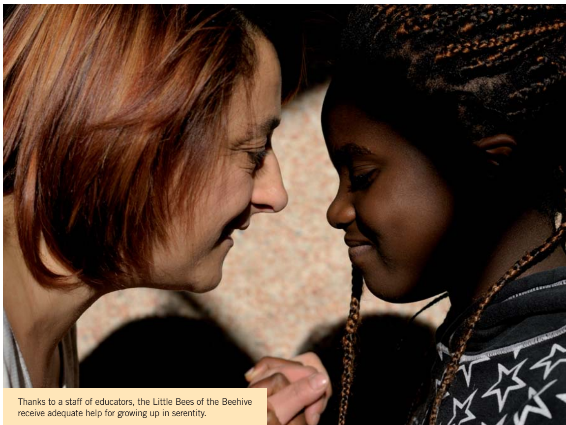
Thanks to a staff of educators, the Little Bees of the Beehive receive adequate help for growing up in serenity.

There are many benefactors who donate, even with small offers, to the Beehive. But there are many people who are not in a position to make cash donations. This does