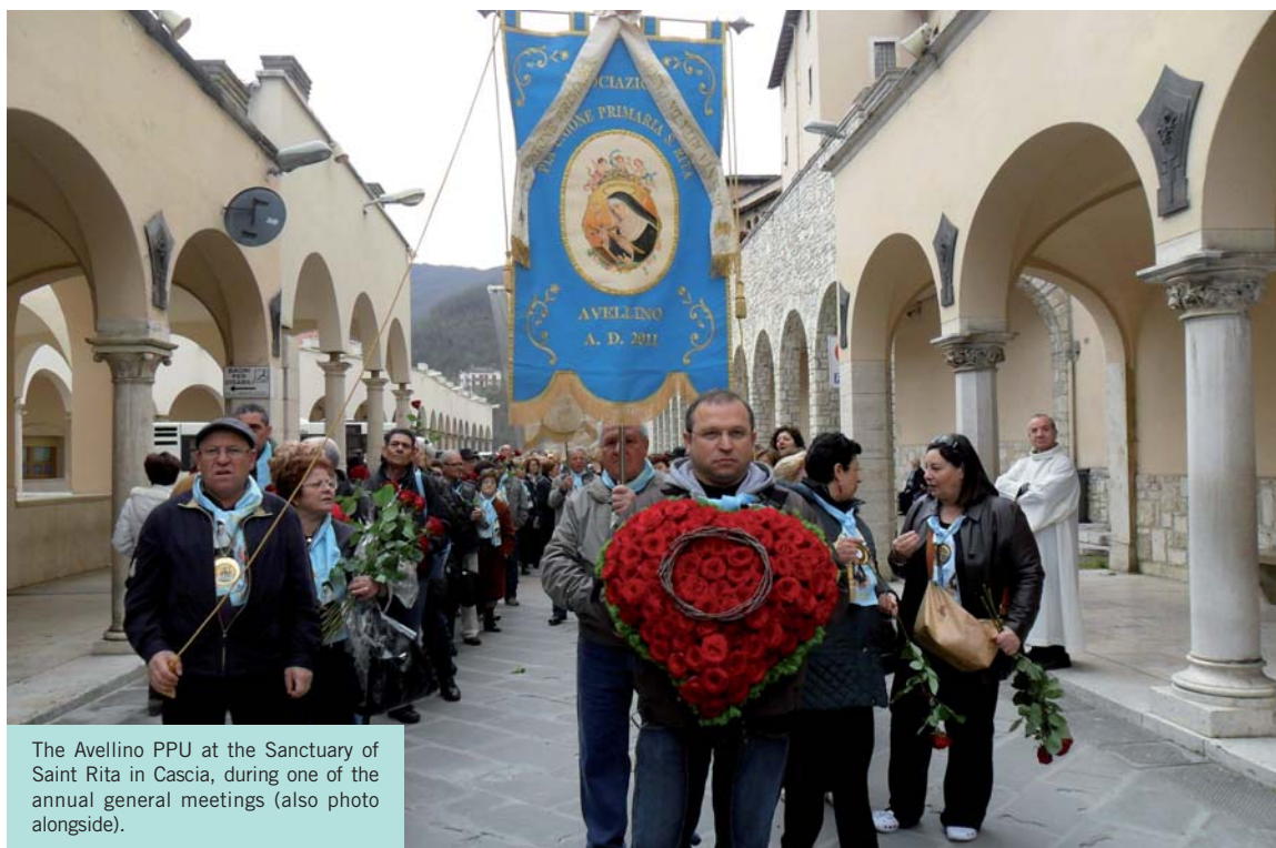
The Avellino PPU at the Sanctuary of Saint Rita in Cascia, during one of the annual general meetings (also photo alongside).