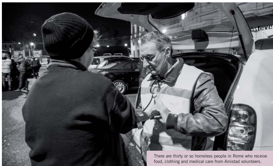
There are thirty or so homeless people in Rome who receive food, clothing and medical care from Amistad volunteers.