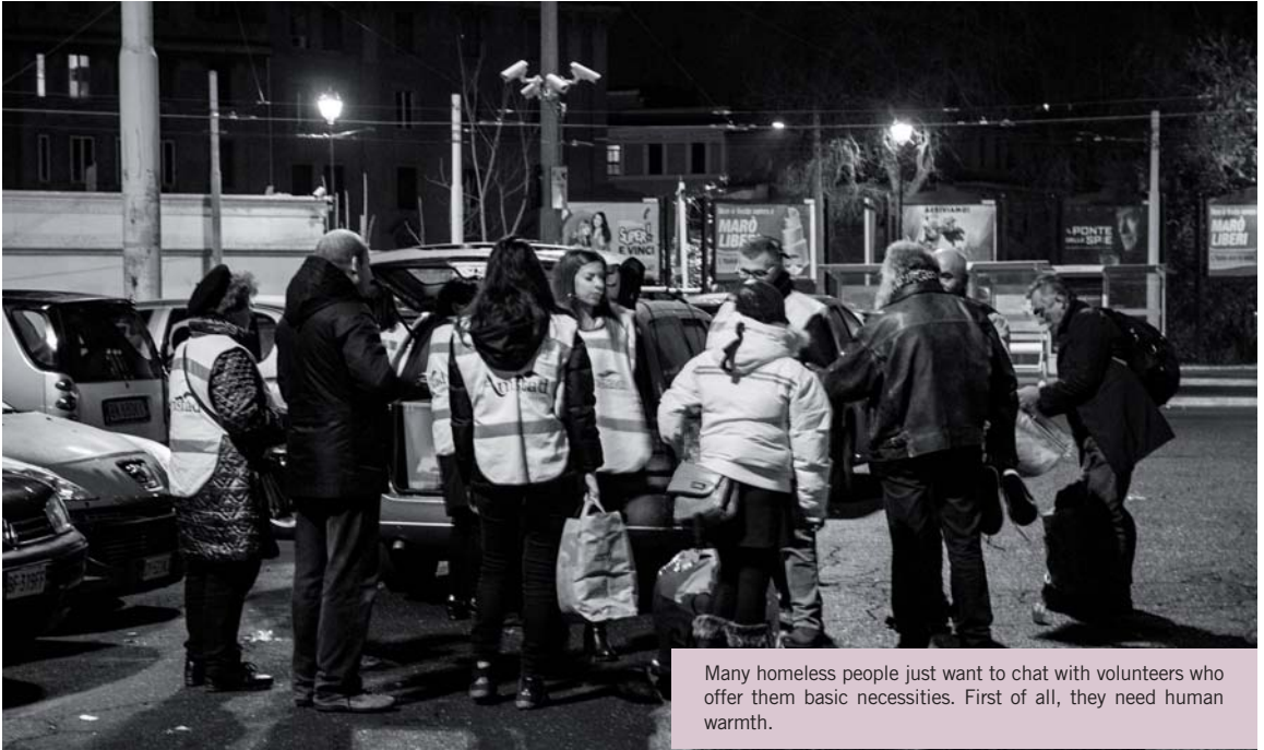
Many homeless people just want to chat with volunteers who offer them basic necessities. First of all, they need human warmth.