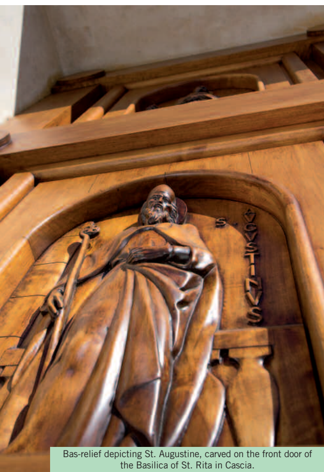
Bas-relief depicting St. Augustine, carved on the front door of the Basilica of St. Rita in Cascia.

“Great are you, O Lord, and exceedingly worthy of praise ... Despite everything, man, though but a small a part of your creation, wants to praise you. You yourself encourage him to delight in your praise, for you have made us for yourself, and our heart is restless until it rests in you. How shall I call upon my God, my God and my Lord, when by the very act of calling upon him I would be calling him into myself? Who will grant it to me to find peace in you? Who will grant me this grace, that you should come into my heart and inebriate it, enabling me to forget the evils that beset me and embrace you, my