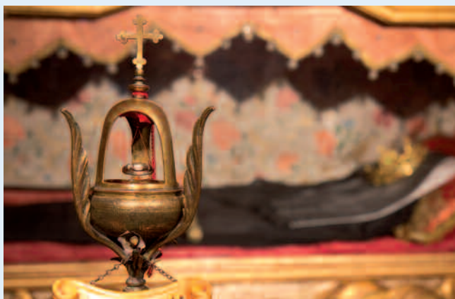
The wedding ring of Saint Rita (in the foreground) is formed by two hands grasping each other, a symbol of the reciprocity and loyalty that love requires.

“This is what Easter is: it is the exodus, the passage of human beings from slavery to sin and evil to the freedom of love and goodness. Because God is life, life alone, and we are his glory: the living man”(Urbi et Orbi Message of Holy Father Francis, Easter 2013). This passage must be implemented in the here and now that we live in our daily lives for the people we love. The relationship between each one of us and God is a relationship of Love. So, I ask you to reflect on this and on an action: to commit ourselves together to pass from the slavery of “I” to the