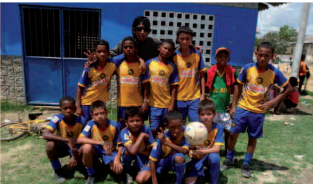
One of the works of charity for young people, in the name of Saint Rita, is the football tournament of Barranquilla

Thanks to these social works, recalling the values of the beloved Saint Rita, it is possible to bring a little peace to the troubled Colombia.