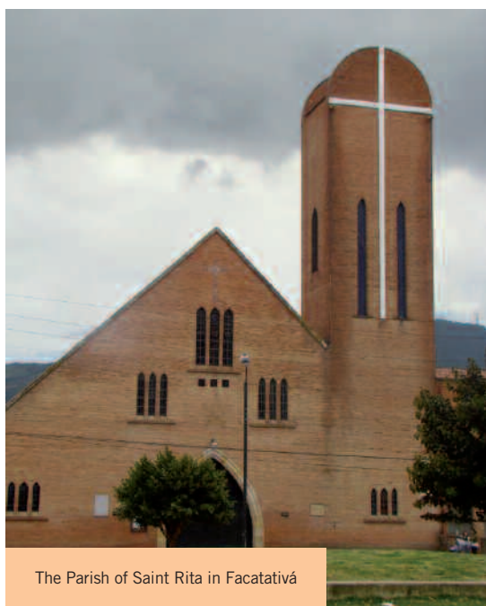
The Parish of Saint Rita in Facatativá

On 22 May, Facatativá filled up with devotees