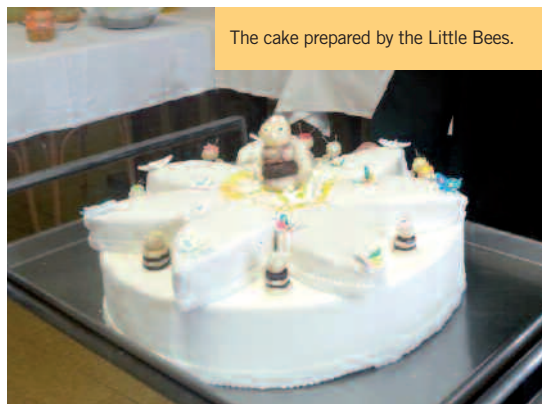
The cake prepared by the Little Bees.