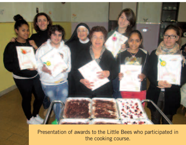
Presentation of awards to the Little Bees who participated in the cooking course.

On 18 January, we celebrated the feast of Blessed Fasce