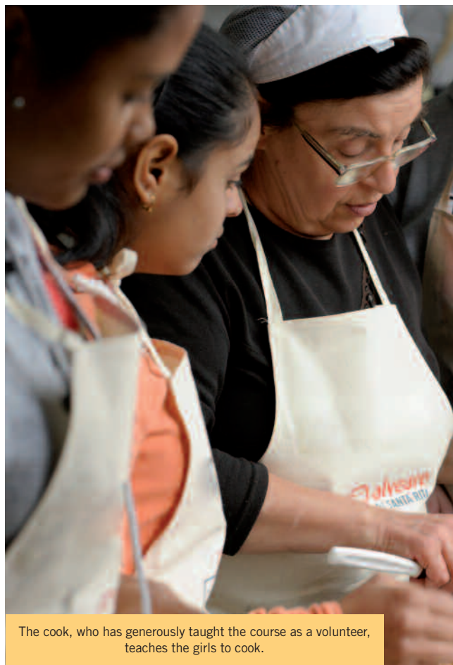
The cook, who has generously taught the course as a volunteer, teaches the girls to cook.