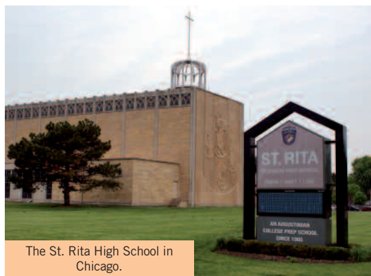
The St. Rita High School in Chicago.

Unity and Love. What are these values for you? We call these our core values because we represent them in our lives.