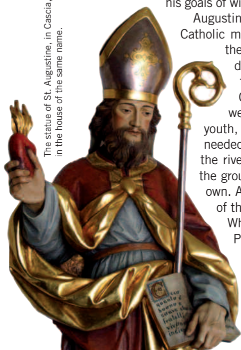
The statue of St. Augustine, in Cascia, in the house of the same name.

The turning point in life came in Carthage when, at the age of 19, he read Cicero's book Hortensius . The young student realised that he was a philosopher, a seeker of immortal wisdom. The pagans did not set themselves the problem of faith, so wisdom, to which Augustine was to dedicate all his efforts, was to be found