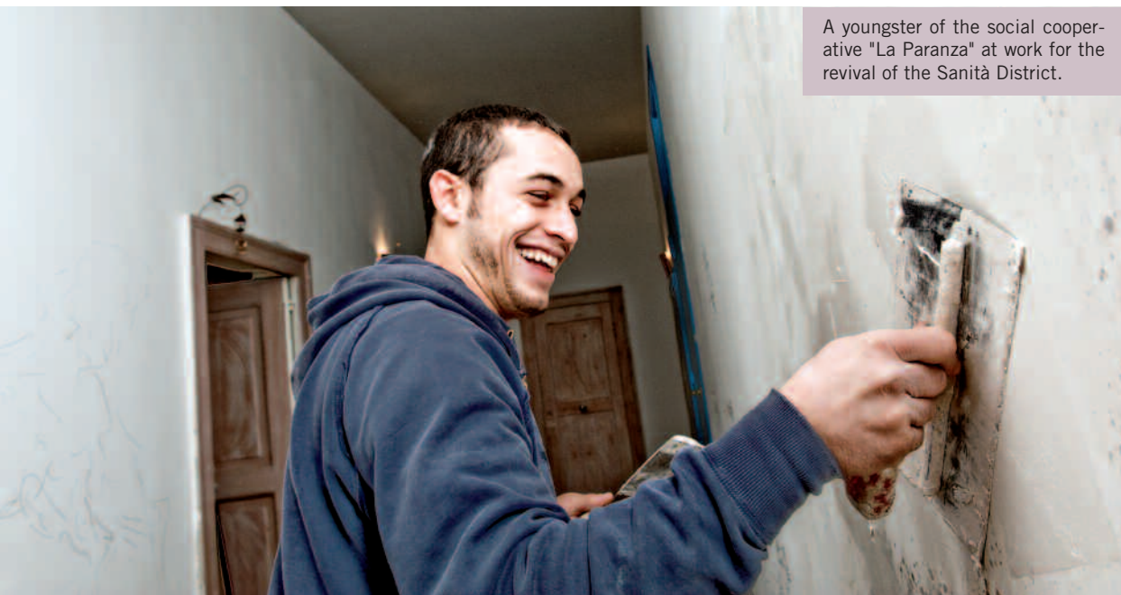
A youngster of the social cooperative "La Paranza" at work for the revival of the Sanità District.