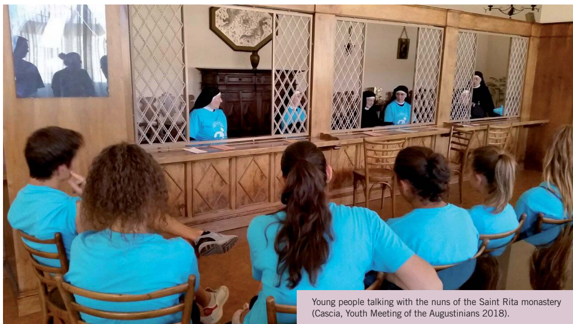
Young people talking with the nuns of the Saint Rita monastery (Cascia, Youth Meeting of the Augustinians 2018).