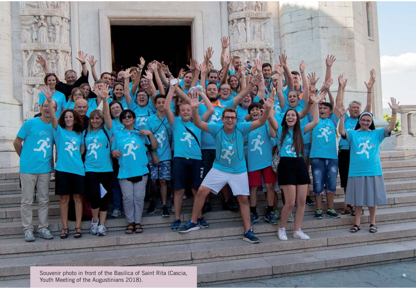
Souvenir photo in front of the Basilica of Saint Rita (Cascia, Youth Meeting of the Augustinians 2018).

mous value, cannot be transmitted as they have lived it, but must be reworked because it is incomprehensible, sometimes even to themselves. In this sense, the figure chosen by the Synodal Fathers for expressing this concept is wonderful: Peter and John running to the now empty tomb. John is faster, but he lets Peter go in first. This implies a relationship of friendship, acceptance and mutual respect so profound that it is almost a mystery. And it is the key to interpretation: learning to know each other, bringing each other into play, because only by walking together is one able to enter into the Mystery of Christ. It is a revolutionary passage.