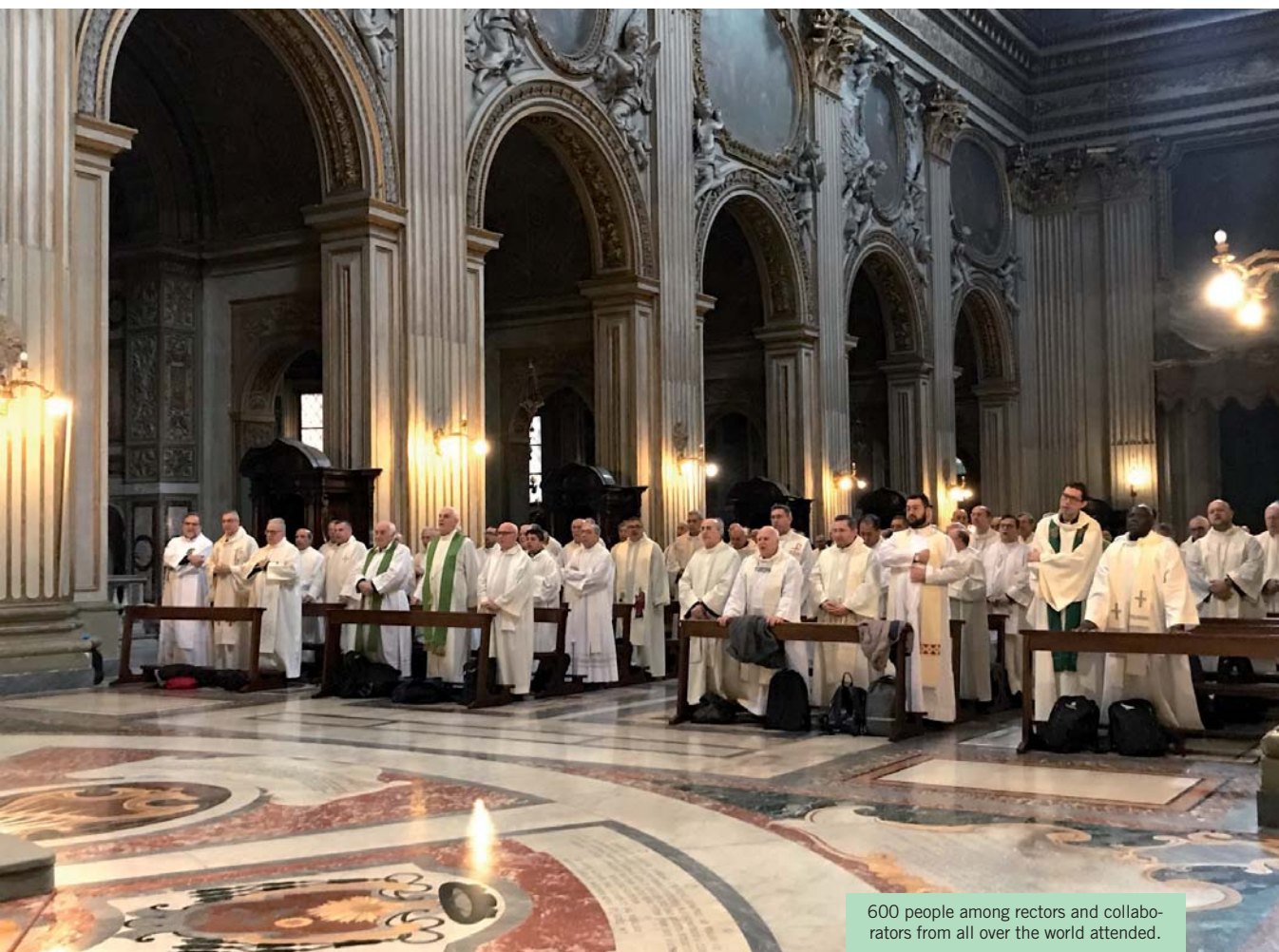
600 people among rectors and collaborators from all over the world attended.

place in which to purify yourself with the Sacrament of Reconciliation for returning to your own life. The conference was intended as an opportunity to allow the rectors of the whole world to experiment new forms of evangelisation. At the end of the event, the participants were received by the Holy Father in the suggestive Sala Regia of the Apostolic Palace, a hall located between the Sistine Chapel and the Pauline Chapel. Also Pope Francis, in his speech to those who intervened on the subject of welcoming, said: "How much we need Shrines in the daily