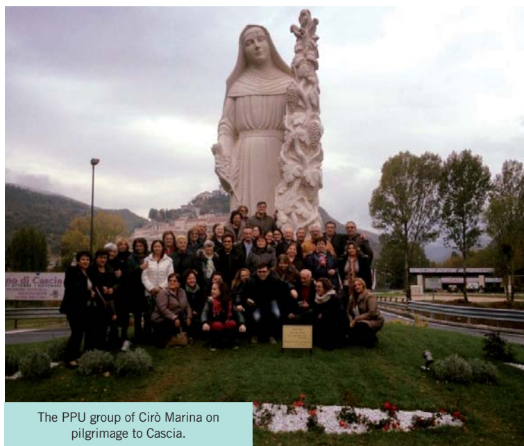
The PPU group of Cirò Marina on pilgrimage to Cascia.

Every Thursday, the community meets to invoke Saint Rita