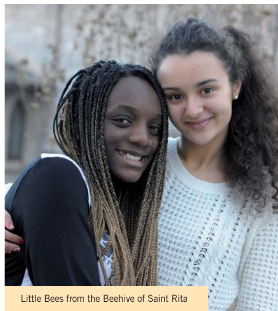
Little Bees from the Beehive of Saint Rita

Symbol of the patron saint of impossible cases, the Rose of Saint Rita is cultivated in a pot. A floral thought to give to yourself or be given to those you love, making a gesture of solidarity. ■