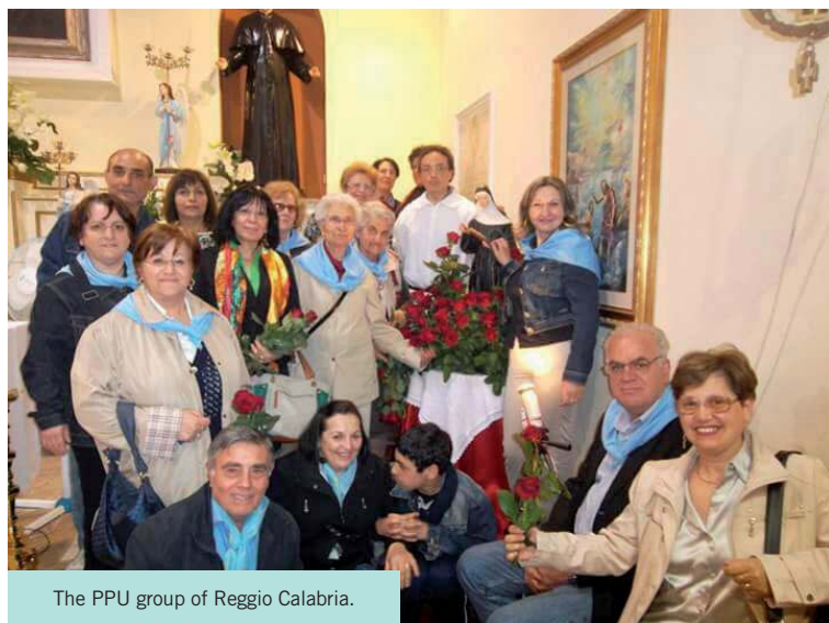
The PPU group of Reggio Calabria.