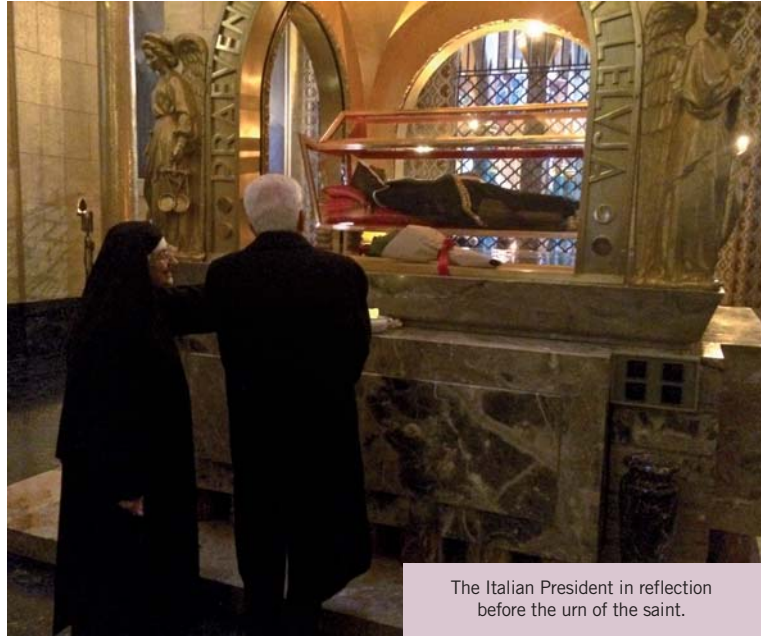
The Italian President in reflection before the urn of the saint.