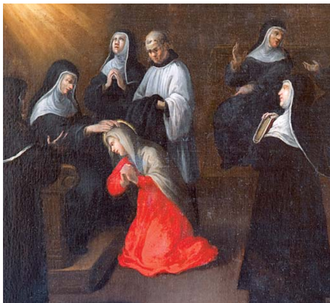
Monastery of Saint Rita of Cascia, The religious habit (XVIII century).

In her life, Rita lived a troubled existence, but no more than many other women of her time: forced to marry, and which woman was not? Violent husband (it is said) and today we are sadly accustomed to vi-