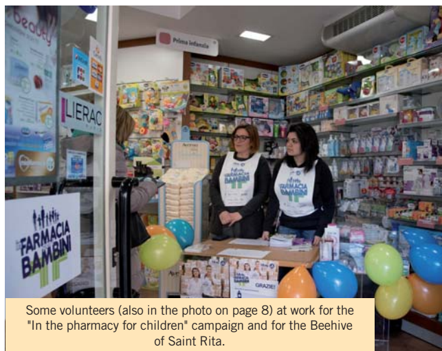
Some volunteers (also in the photo on page 8) at work for the "In the pharmacy for children" campaign and for the Beehive of Saint Rita.