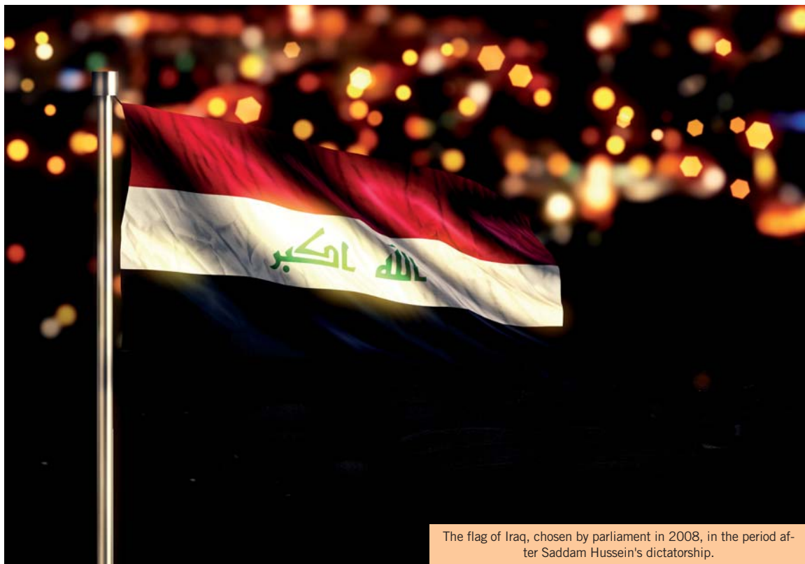
The flag of Iraq, chosen by parliament in 2008, in the period after Saddam Hussein's dictatorship.

the Novena of Saint Rita. And the image of the saint is also present in many homes. The days of the Novena of Saint Rita are a big feast for everyone, even if now, unfortunately, the tone is more subdued ... because there is no security, no peace, but car bombs and suicide bombers ... many people are afraid of big gatherings ... and then so many of our faithful have left ... with the U.S. occupation, more than half the Christians left the country. The country has been emptied of Christians, but also Muslims migrate, and for us this is an enormous misfortune. If there were slightly less than 1 million Christians in Iraq before the occupation, there are now about 400,000. In the city of Baghdad, we had thirty or so churches, now there are 15 or 16 that "function".