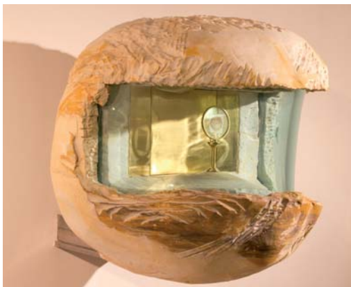
The Eucharistic miracle displayed in the Lower Basilica in Cascia, beside the relics of Blessed Simon of Cascia.

blood to his Convent in Cascia. Because he was surrounded by high esteem for his upright style of life and the beauty and power of his preaching and his writings, when he spoke of the miracle of the Eucharist, showing it to his Augustinian brothers and the faithful, he was certainly believed and reverence for the miracle began. Fra Simon died in 1348 as a result of the great plague that struck Europe. The Eucharistic miracle that he donated to his town is well attested to in historical documents. It is referred to in the Statutes of Cascia of 1387; papal bulls of 1401 and 1408 approve the miracle and regulate the great popular devotion