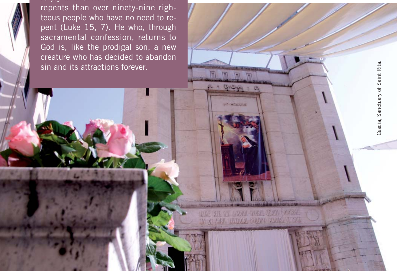
Cascia, Sanctuary of Saint Rita.

young people, and also consecrated and religious people. I can say that all the states of life and categories are represented. And because acting is determined by being, the patterns of behavior, the concrete choices in our lives cannot fail to express the beliefs that guide them, indeed, acting verifies, more than words and speeches, what we believe in and that which effectively directs our existence. Certainly, the people