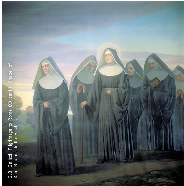
G.B. Galizzi, Pilgrimage to Rome (XX. cent.), Chapel of Saint Rita, inside the Basilica.

One of the most common images used to express an entire life is that of the journey.