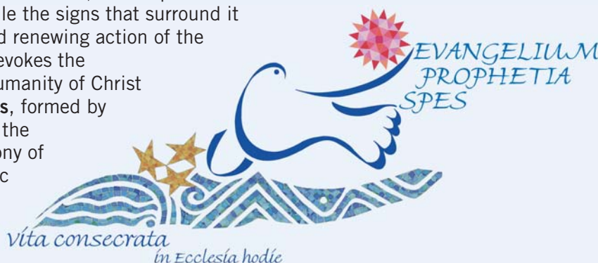
Logo of the Year of Consecrated Life.