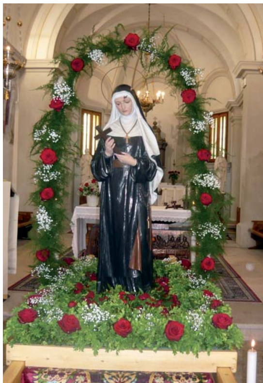
The devotion to the patron saint of impossible causes is deeply felt by the inhabitants of the town.

tion and enthusiasm among the citizens of Facen. For many years, this close-knit group has been meeting, usually on a Wednesday, to share and organise initiatives for the town. And so it was also for 22 May last year.