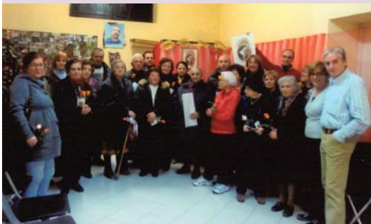
A group of people from Monteferrante during the celebrations of the 25th anniversary of the blessing of the statue of Saint Rita, 3 January 2013.

the psychological pressure that doesn't allow you to relax for a moment and you can't afford to be sick. In the hospital, you must be even more watchful than at home, plus you don't have the amenities that you have at home because the person suffering from ALS needs a suitable bed and, besides, you can't expect the nurse to be at the side of the sick person 24 hours a day; in addition, such patients have an immune system at zero so the situation becomes more dangerous. In the final moments, he cried in continuation. First, he tried to hold himself back and