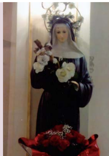
The statue of Saint Rita, in the parish of St. John the Baptist, Monteferrante (Chieti).