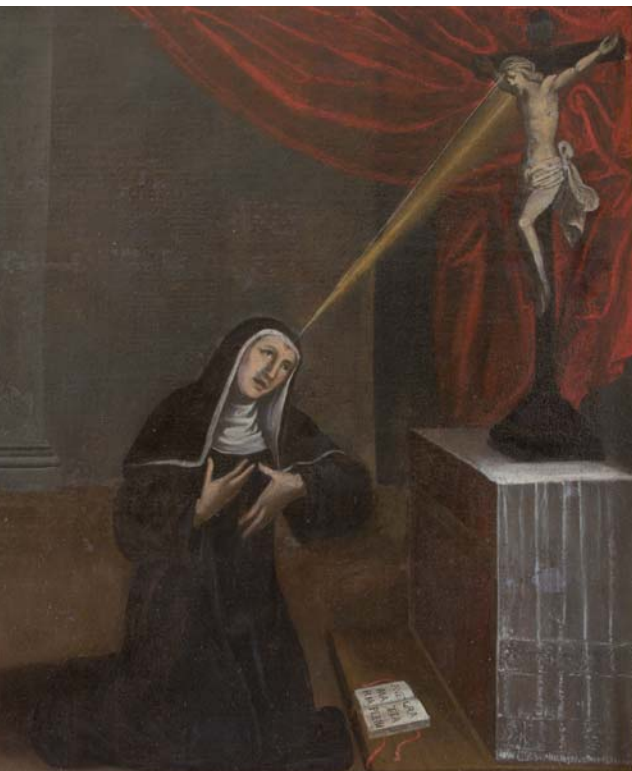
Ancient Monastery Choir, Stigmatisation of Saint Rita (unknown author, XVII century).