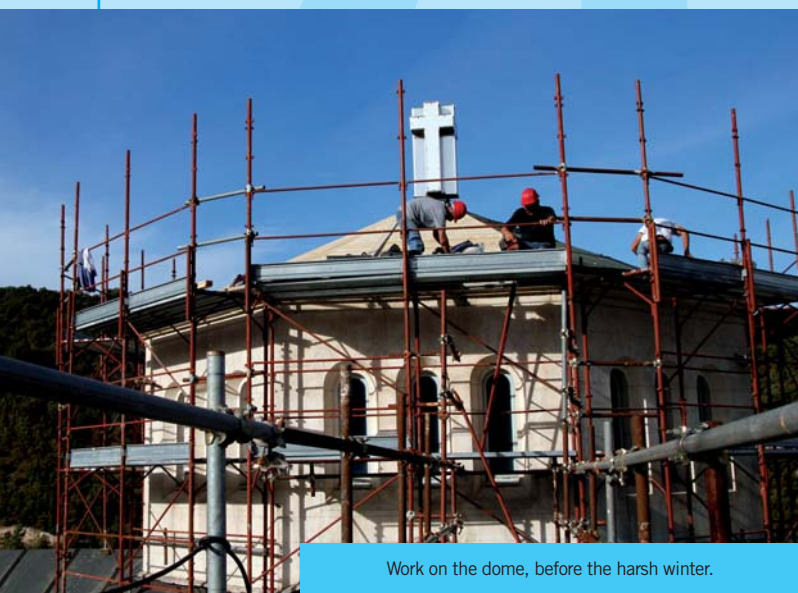
Work on the dome, before the harsh winter.

Dear friends of Saint Rita, at the end of 2013, we nuns wrote to many of you, asking for help to renovate the dome of the Basilica. And your loving and generous response was amazing! Thanks to the contributions of so many devotees of the Saint, we quickly reached the figure of 20,000 euros which was necessary for the most urgent intervention on the dome. Despite the severe winter, work has gone ahead actively and we are pleased to announce that the dome of the Basilica has been made safe through re-roofing.