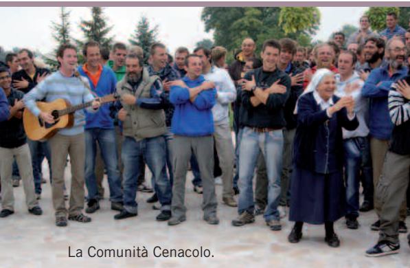
La Comunità Cenacolo.