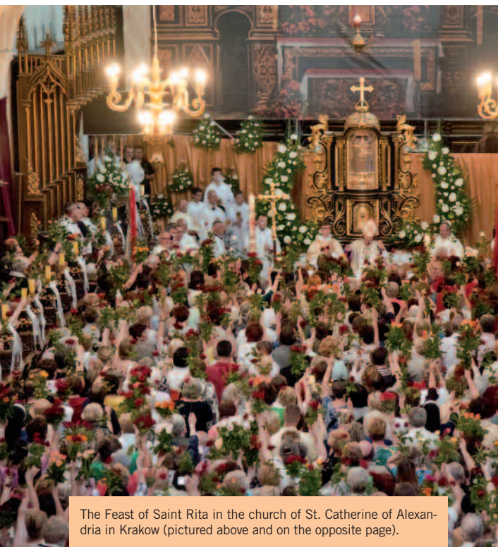
The Feast of Saint Rita in the church of St. Catherine of Alexandria in Krakow (pictured above and on the opposite page).

Worth knowing. Poland is a country with a Catholic majority. The cult of Saint Rita spread slowly through the apostolate of Augustinians present in the country for centuries. In the seventeenth century, 19 monasteries linked to churches for worship and the apostolate exercised by the Augustinians were reviewed. In Krakow, in the chapel of the cloister of the convent of Saint Catherine, there is a fresco of Our Lady of Consolation (XV cent.). At the beginning of the 16 th century, the figures of St. Augustine and St. Nicholas of Tolentino were added to the image, reflecting the influence that the Augustinians had acquired at that time.