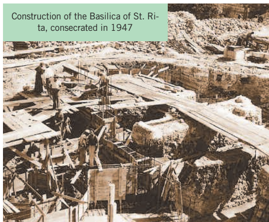
Construction of the Basilica of St. Rita, consecrated in 1947

heart of spirituality and attracts millions and millions of pilgrims, if Cascia is known all over the world and has become a necessary “stop-off” for many believers, if Santa Rita is a model for many mothers and many nuns scattered everywhere, the reason lies in the initiatives undertaken and carried out by the Mother.